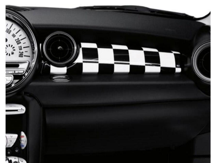
Dashboard Checkered Flag