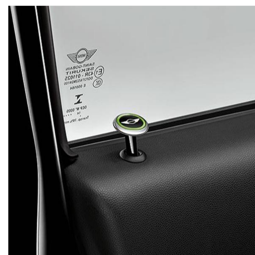
MINI Door Lock Caps