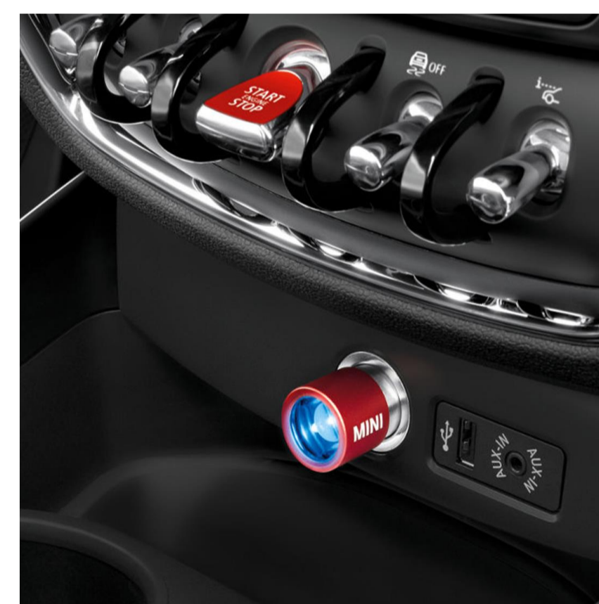
MINI LED Chargeable Flashlight